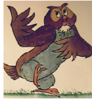
The Frontenac Times Advice Column

Now this may be talking with one leg thrown over the crib rail again .... but if this is a Command and Staff Course, then wouldn't it stand to reason that the SALs should include an student appointment as the Commander ? Perhaps if a few more of the time-consuming colouring products were provided, then a five-person team could do the cerebral parts of the IPB/OPP cycle while the sixth portrays, under the DS' supervision, the Commander's responsibilities for analysing the planning cycle and moulding the result to his/her intentions.