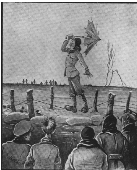
Every plan should be a balance of skill and daring. (An LFSC candidate presents his plan on the Ganonoque TEWT.)